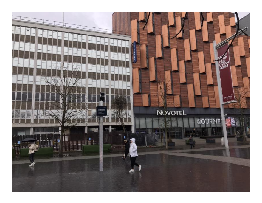
Image 1 (above) demonstrates the proximity of the proposed beer garden to the neighbouring hotel.

Image 1 (below) demonstrates the proximity of the proposed beer garden to the neighbouring residential accommodation.